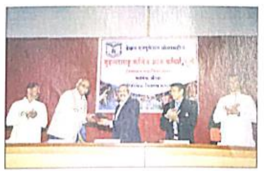
Gymkhana Day Function