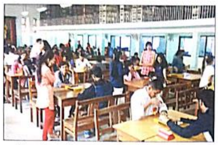
Visually challenged Students Inter Collegiate Chess Tournament